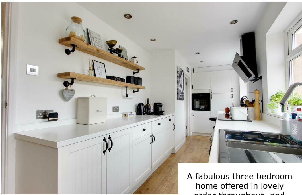
A fabulous three bedroom home offered in lovely order throughout, and just a short walk from the Village centre.